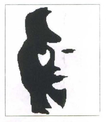
Man Playing Horn... Or Woman Silhouette?